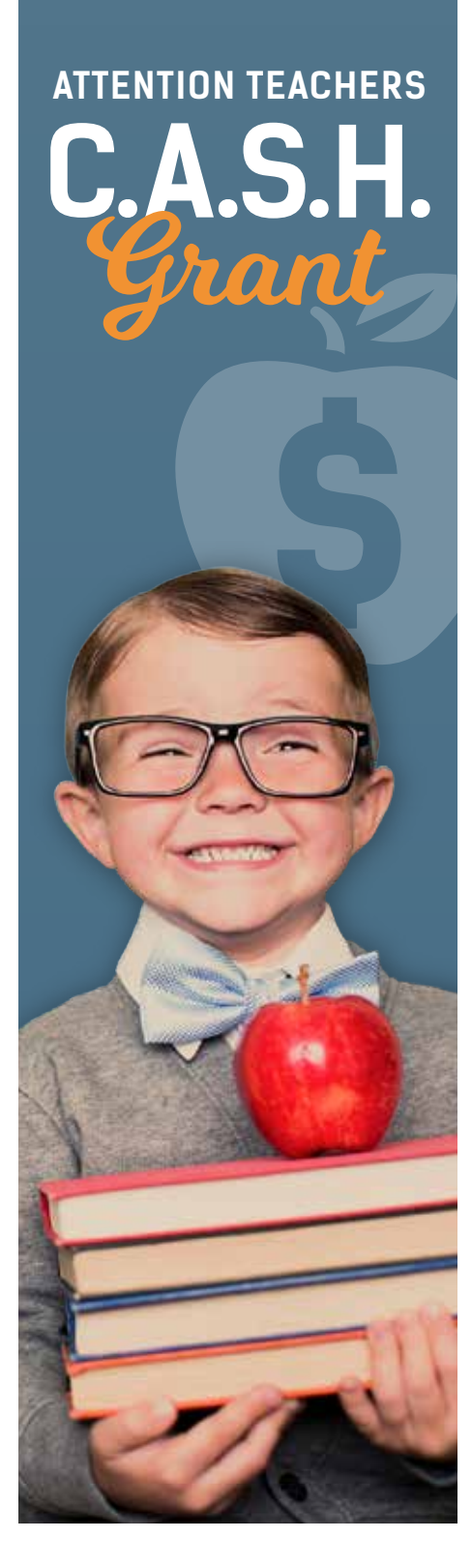
GRANTS UP TO $400 Apply online by Oct. 15 hcu.coop/cashgrant

The Salthawk Center not only serves as a training ground for preparing young adults to enter the workforce, it also gives all students the opportunity to learn how to manage their money and prepare for a future of financial well-being.