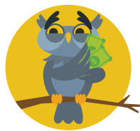
THE WARY OWL