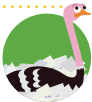
THE AVOIDING OSTRICH

Directions: Use this sheet to keep track of what you learn about money personas during your discussion and the presentation.