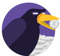
THE STASHING CROW