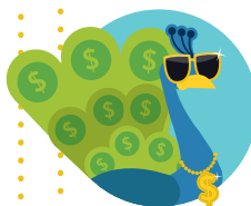
THE STRUTTIN' PEACOCK